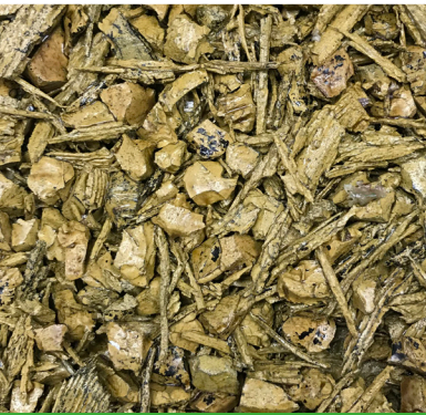
- Harvest Beige