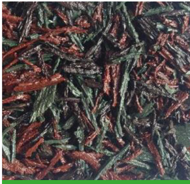
- Red, Green & Brown