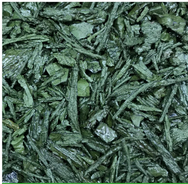
- Spring Green