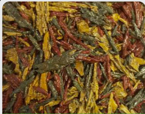
- Red, Green & Beige