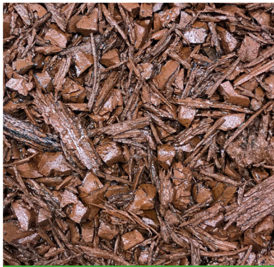
- Acorn Brown