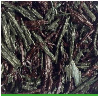
- Green & Brown