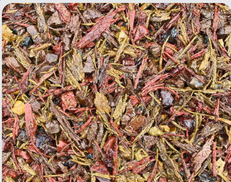
- Other mixed colour