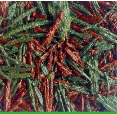
- Red & Green